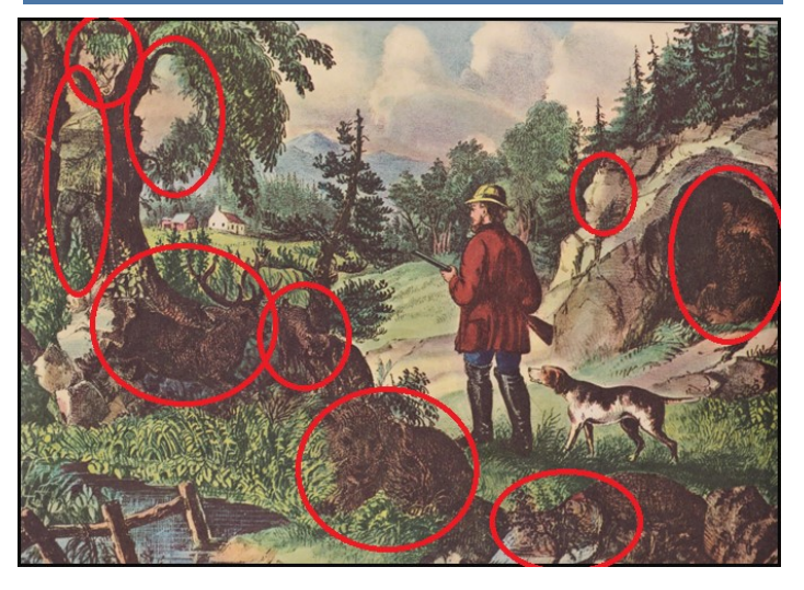
Did we miss anything? What else did you find bewildering about this image? The team here at Fairfield House had many chats looking for all the hidden things in this mage.